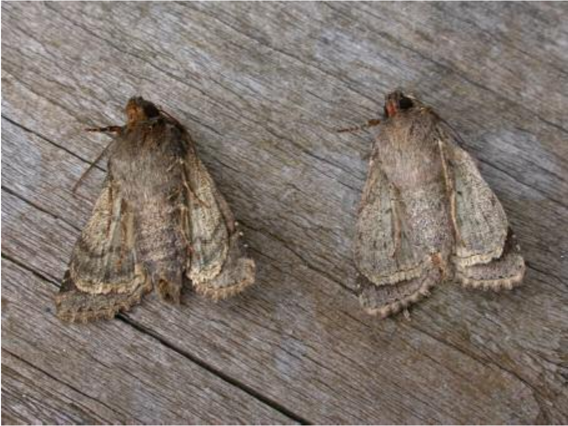
Jon Clifton Kestrel Cottage Hindolveston Norfolk